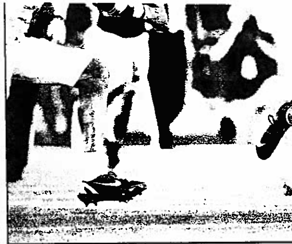
WVU tight end Grayson Barnes (right) runs with during last weekend's game against Pitt.

The Kansas football team features something almost unthinkable in modern college football: a sixth-year senior quarter-