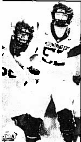
against Robert Morris.