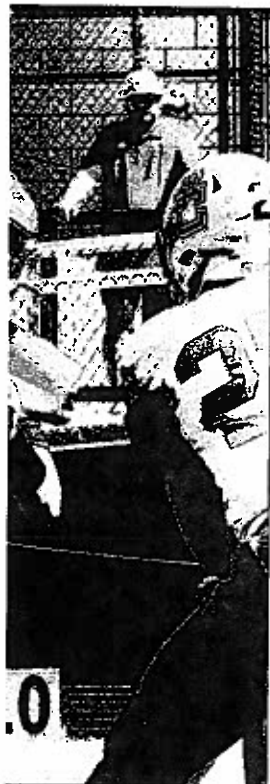
as a throw on Saturday