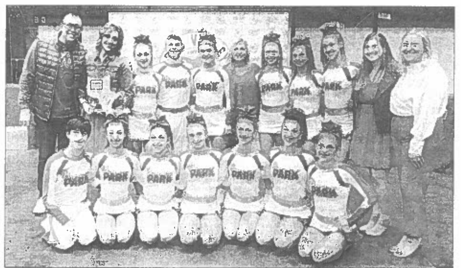
The Wheeling Park Patriots pose with their OVAC 5A Championship on Saturday inside WesBanco Arena.