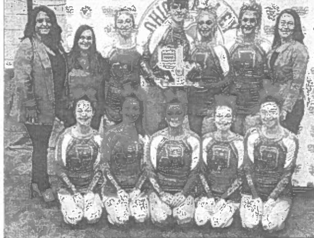
The Barnesville Shamrocks pose with their OVAC 3A Championship trophy on Saturday inside WesBanco Arena.