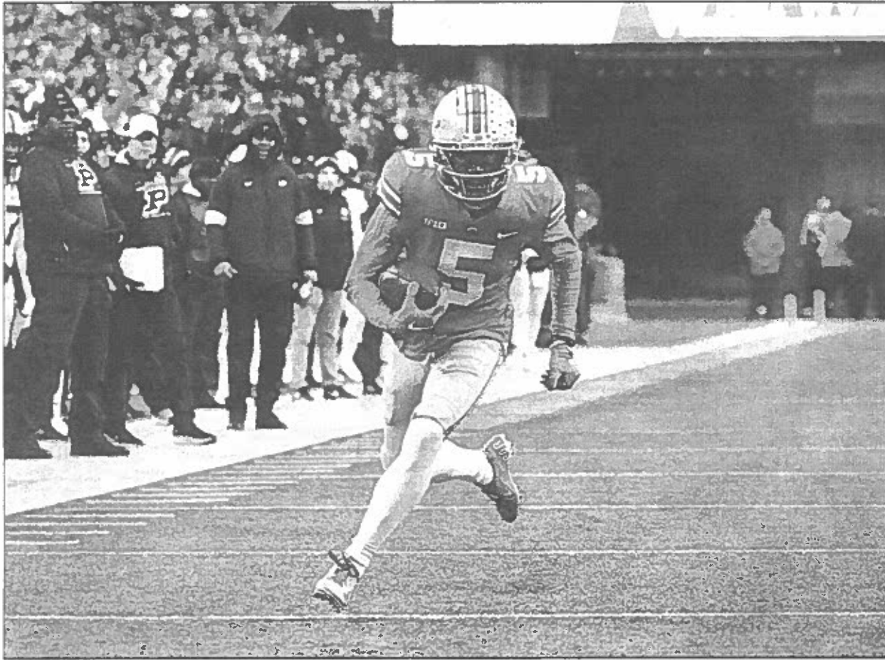
OHIO STATE wide receiver Garrett Wilson runs toward the end zone for one of his four touchdowns during Saturday's game against Purdue at Ohio Stadium.