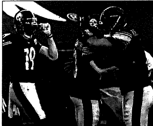
Pittsburgh's JuJu Smith-Schuster (19), James Washington (13) and Ben Roethlisberger, right, celebrate a touchdown catch on Sunday.