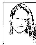
GOOLIE Buckeye Local