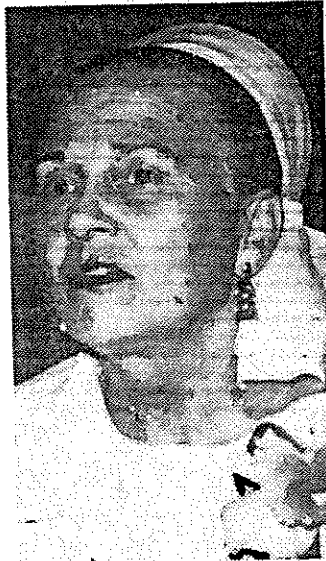
MRS. WOODY HAYES

"I was proudest of him at that time. He talked to the students until late in the night and would come home so tired that I had to undress him," she