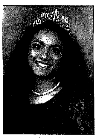
PAUSHALY SAU WHEELING PARK