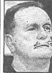
PAUL JACKSON Park. South