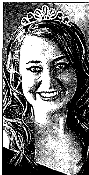
KATIE CARO LINSLEY SCHOOL