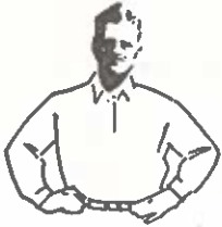
Offside and violation of kickoff formation. (Penalty, 5 yards.)