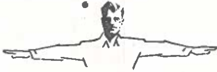
Unsportsmanlike conduct. (Penalty — 15 yards.) For flagrant unsportsmanlike conduct — 15 yard penalty and disqualification.