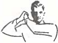
Intentional grounding of forward pass. (Penalty — loss of down and 15 yard penalty from spot of preceding down.)