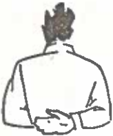
Illegal forward pass.