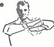
Illegal formation or position of one or more players. (Penalty — 5 yards from where ball was put in play.)