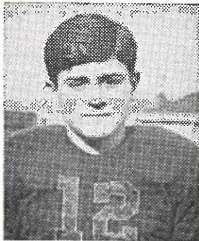
FRIZZI Acting Captain.