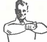
Holding. (Penalty — by offense, 15 yards; by defense, 5 yards.)