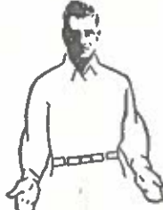
Military salute also used for clipping, followed by striking the back of the knee with hand. (Penalty, 15 yards.) Signal also used for disqualification fouls and for running into or roughing the kicker. In the latter case, the military salute is followed by swinging the leg as though punting.