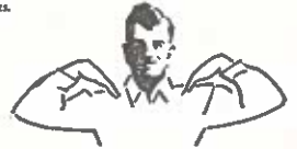
Illegal touching of kicked ball inside opponent's 10-yard line — touchback.