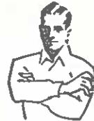
Delay of game or extra time-outs. (Penalty, 5 yards.)