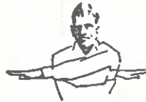
Penalty refused, incomplete pass, missed field goal or conversion, both sides offside, etc.