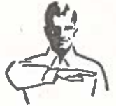
Player illegally in motion. (Penalty, 5 yards. If from shift or huddle, 15 yards.)