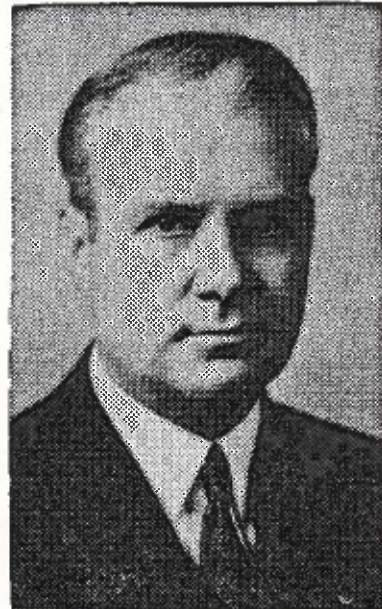
John W. Bricker